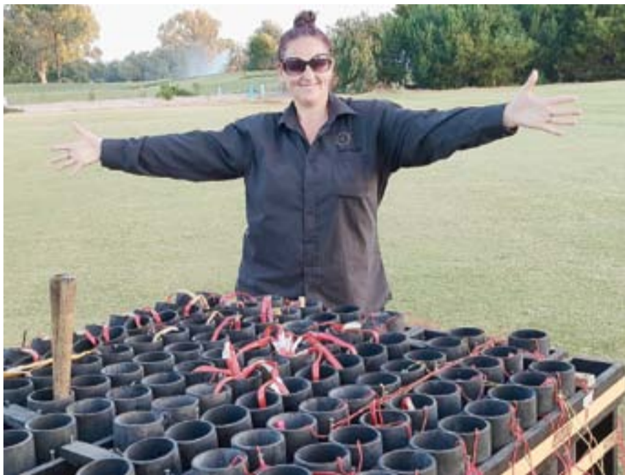
Ashes to Ashes offers a unique yet personal way to commemorate the loss of a loved one by scattering their cremated ashes high into the sky through fireworks.

"We have celebrants and funeral directors on hand, organise cremations if required, deploy fireworks in conjunction with music that is special to the person and their family, as well as own portable PA systems so no matter where you are, we